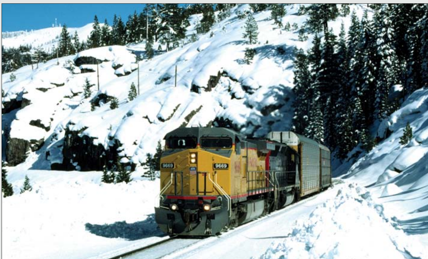
Photo taken on the Roseville Subdivision near Yuba Pass, Calif., in February of 2001.

Are you a photographer? The National Division's Public Relations Department, which produces the Newsletter each month, has received numerous inquiries lately from BLET members volunteering to contrib-