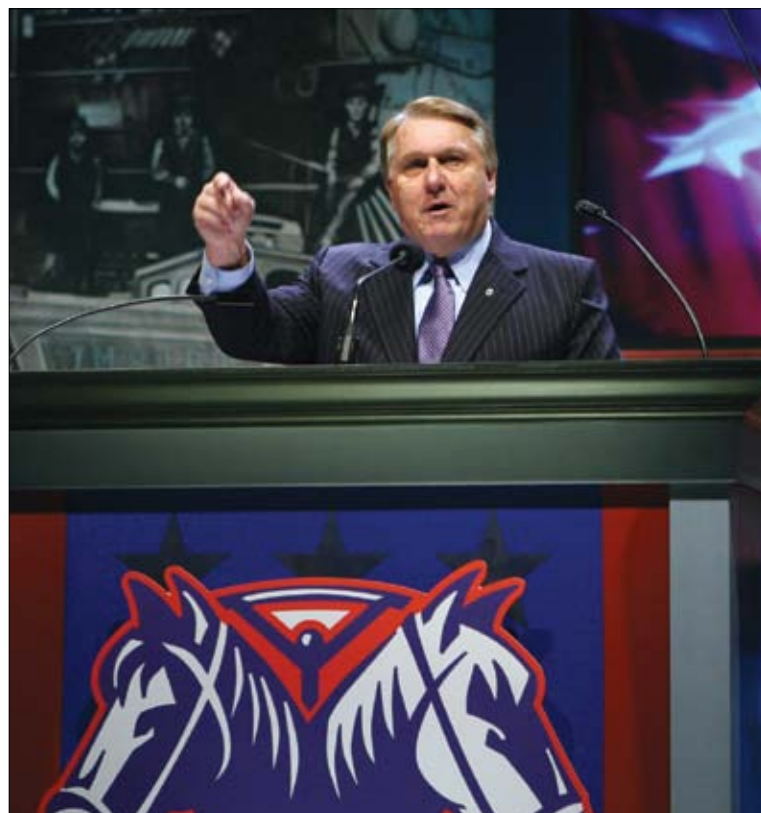
JAMES P. HOFFA TEAMSTERS GENERAL PRESIDENT