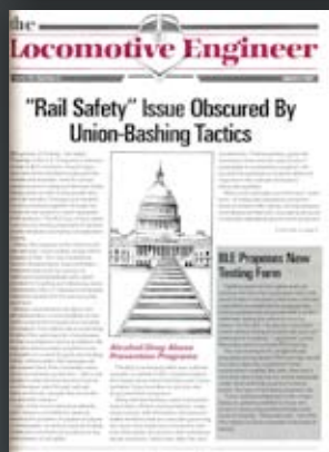
Through the years: BLET newsletter covers over the last 25 years