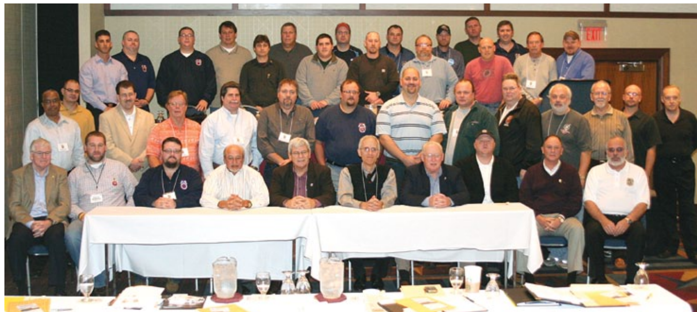
November 8, 2011: Officers, members and guests attending the NS-Northern Lines/ W&LE GCoFA mid-term meeting in Cleveland, Ohio.