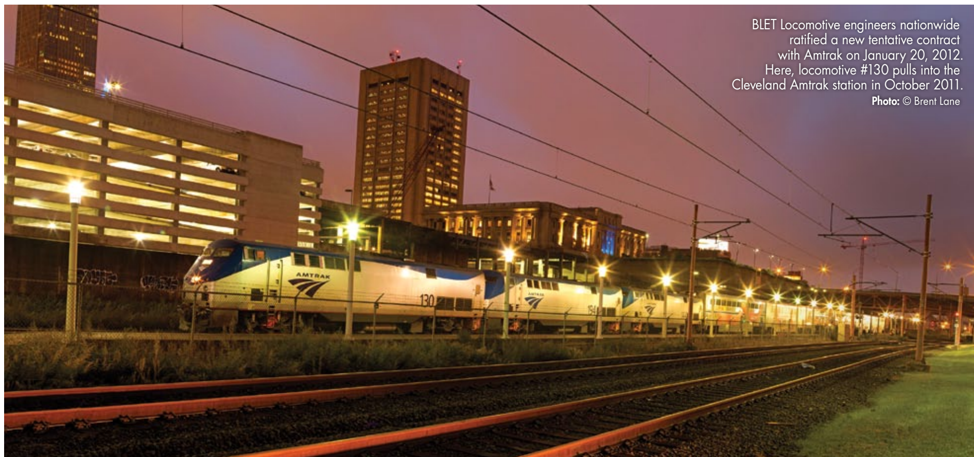
BLET locomotive engineers nationwide ratified a new tentative contract with Amtrak on January 20, 2012. Here, locomotive #130 pulls into the Cleveland Amtrak station in October 2011.

MORE DETAILS ON THE NATIONAL CONTRACT TO COME IN THE UPCOMING LOCOMOTIVE ENGINEERS AND TRAINMEN JOURNAL