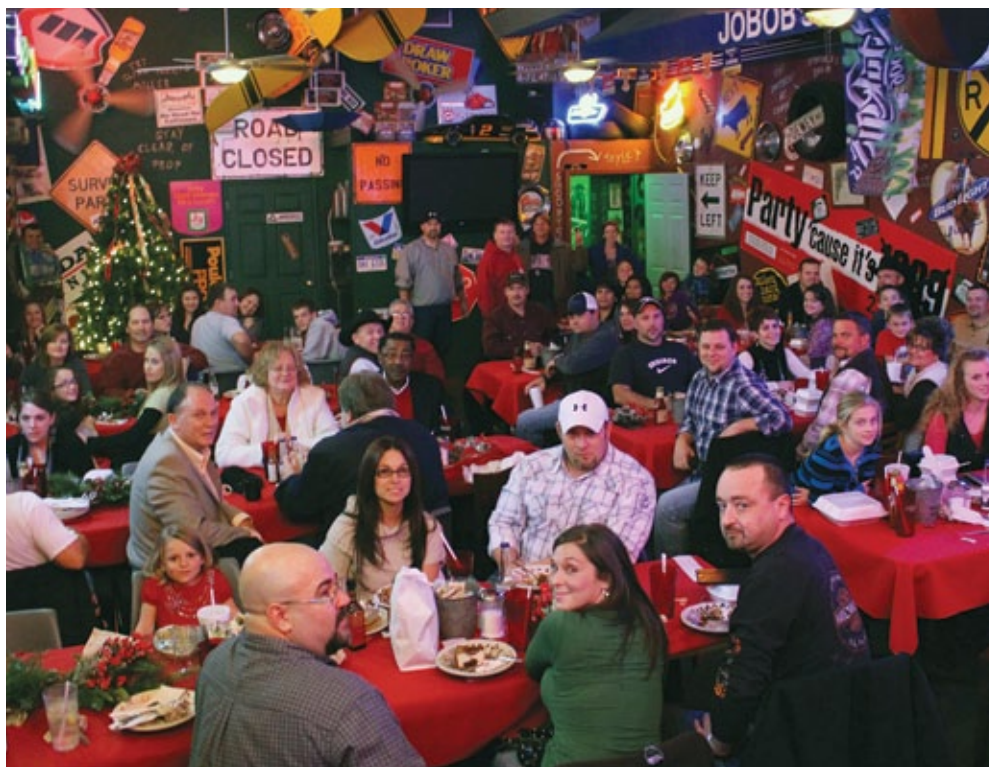
Happy Holidays: Division 569, a close-knit Kansas City Southern Division.