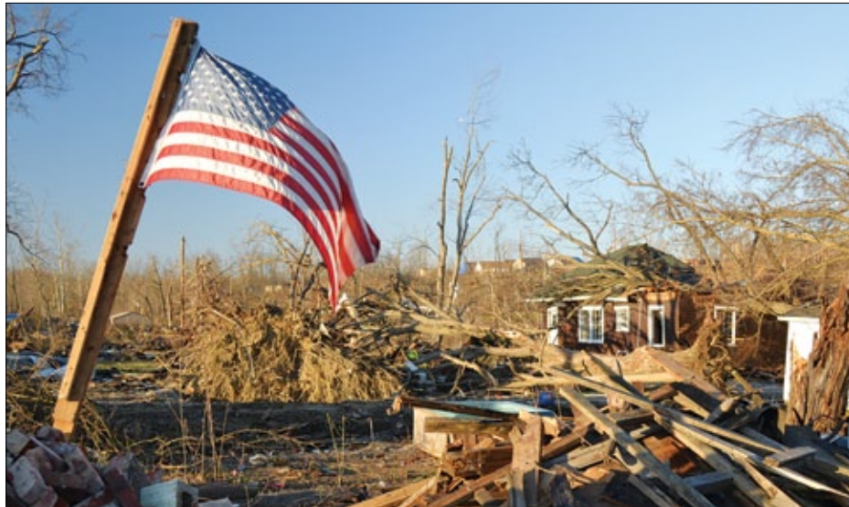
Indiana: A series of tornadoes struck the area on March 2, killed 13 people and left hundreds homeless.

THE DEADLINE FOR APPLICATION IS APRIL 23, 2012.