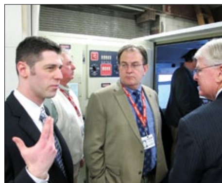
Touring the Volpe Center in Cambridge, Mass.