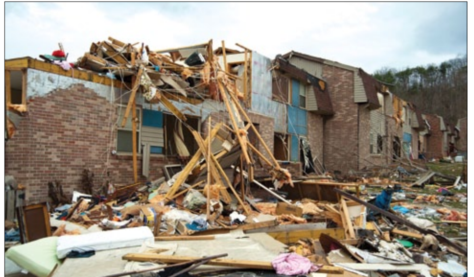
Kentucky: Many residents were displaced when a tornado completely destroyed this apartment complex.

THE DEADLINE FOR APPLICATION IS APRIL 23, 2012.