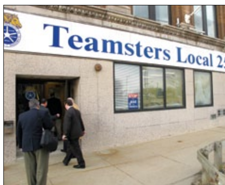
Meeting was held in the board room at Teamsters Local 25