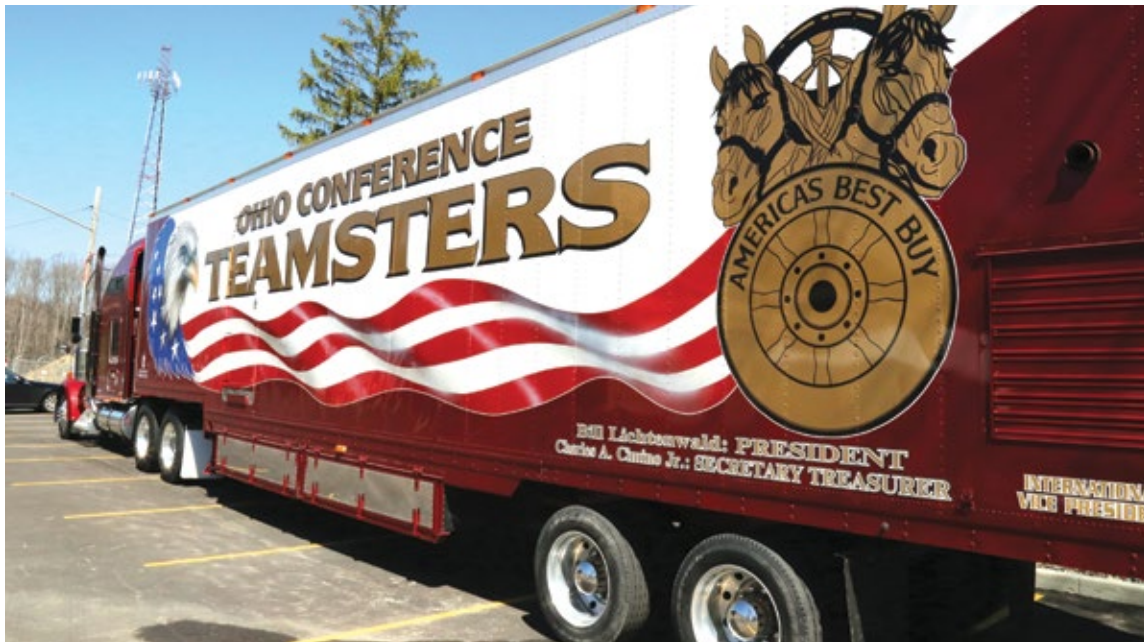
Big rig from the Ohio Conference of Teamsters.

Additional photos and information will appear in an upcoming issue of the Locomotive Engineers and Trainmen Journal