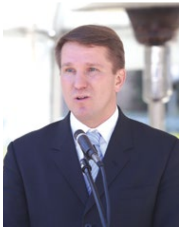
Independence Mayor Anthony Togliatti