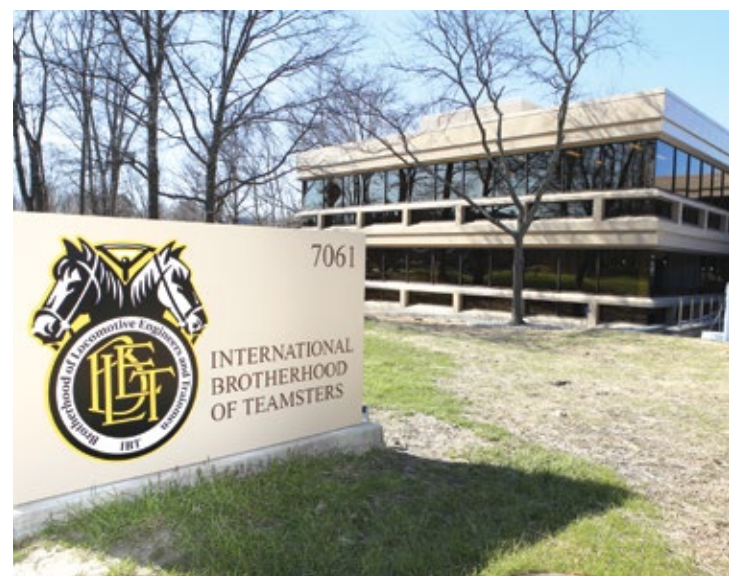
Our new home