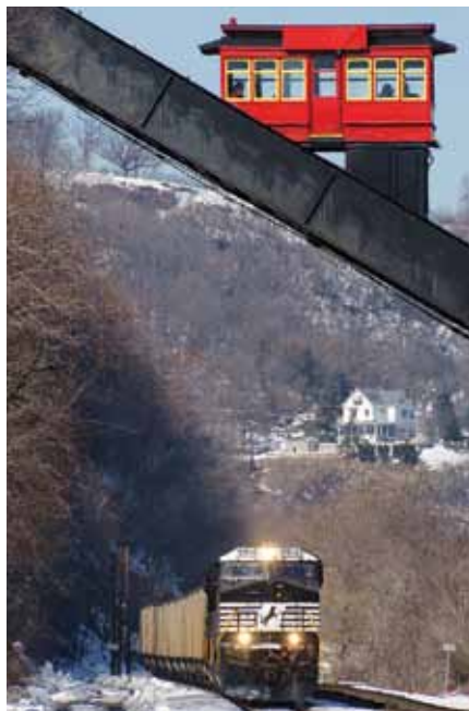
Pittsburgh views: NS train 555 passes below the famous Duquesne Incline (Courtesy BLET Member Rich Borkowski, Div. 255). Station Square displays a lighted fountain each night (VisitPittsburgh.com). The fountain at Point State Park (VisitPittsburgh.com).

Unique to the EUMA this year is a special presentation on SOFA, or Switching