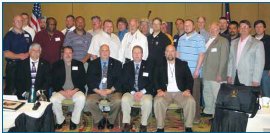
Delegates attending the 14th Quadrennial meeting of the Ohio State Legislative Board.

The Ohio State Legislative Board represents 3,200 active and retired members who work for CSX, Norfolk Southern, Wheeling & Lake Erie, and the Indiana & Ohio Railroads. @@