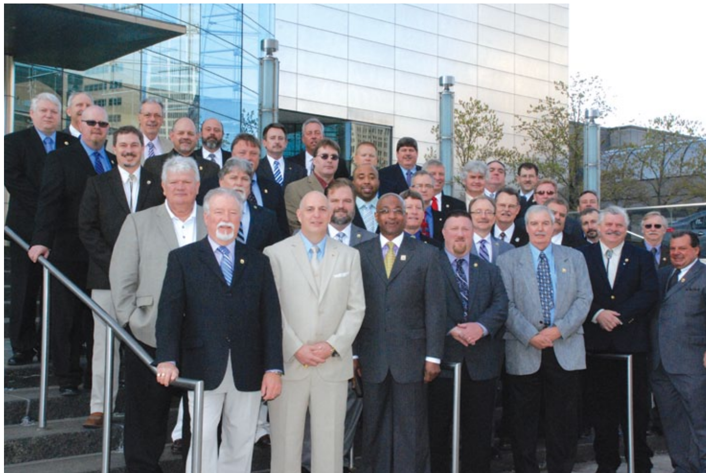
Officers and members of the National Association of State Legislative Board Chairmen (NASLBC) at their 38th annual convention in Detroit, Mich., on May 7, 2013.