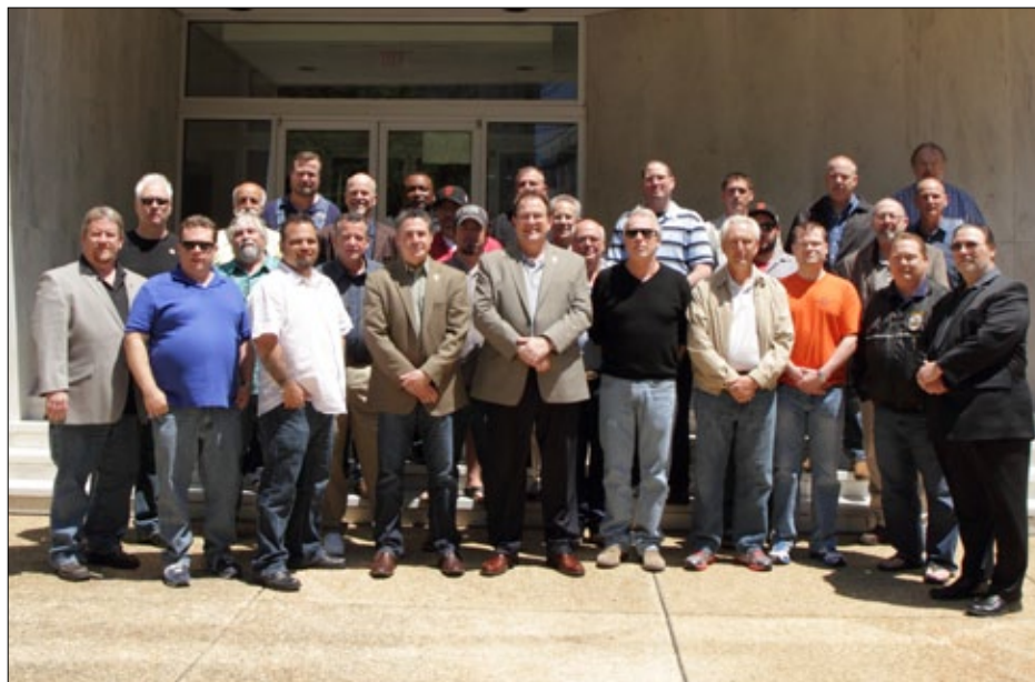
Officers, members and special guests attending the third quadrennial meeting of the Amtrak General Committee of Adjustment in Washington, D.C.