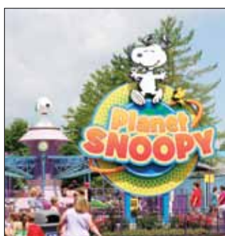
Members enjoyed a trip to Planet Snoopy at Kings Island on June 16.