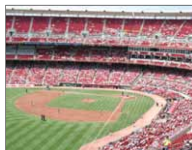
Reds vs. Dodgers at Great American Ballpark, June 17.