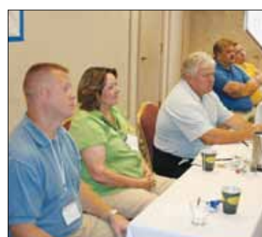
Workshop for Legislative Representatives