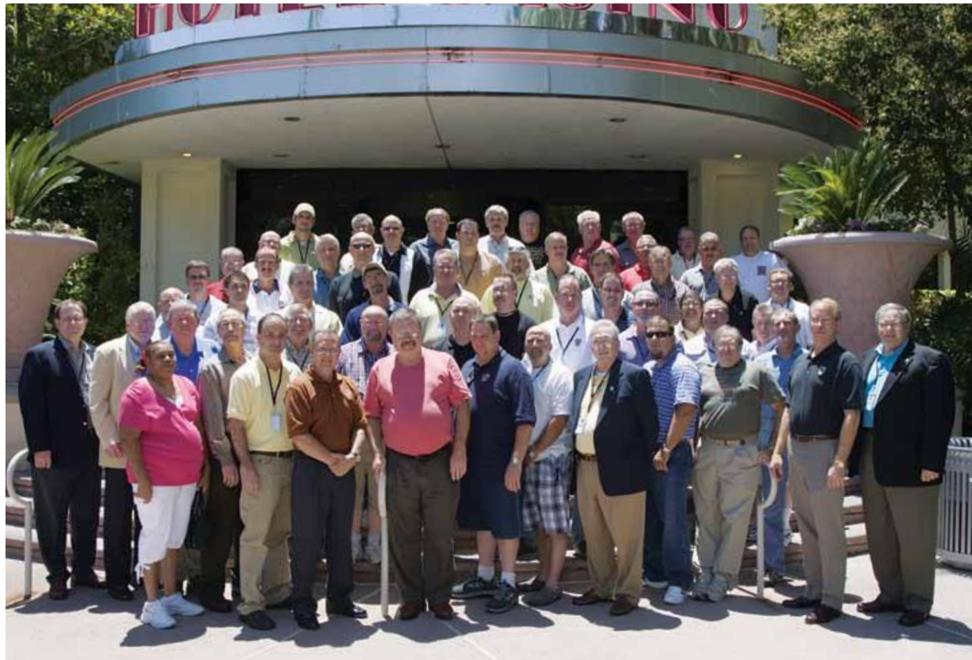
Delegates and guests attending the BNSF/MRL General Committee triennial meeting, July 2010.