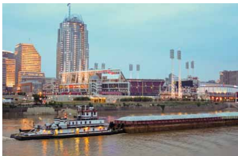
Cincinnati skyline: A view from the riverboat dinner cruise.

Next year's SMA will be held in Asheville, N.C. Dates and other details will be available shortly. @@