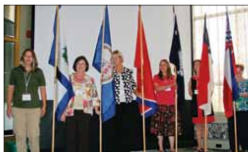
Presentation of the flags during the Opening Ceremonies by the BLET Auxiliary.