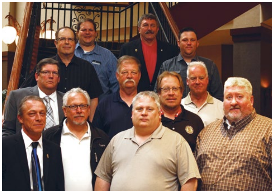
Officers and delegates of the Nebraska State Legislative Board at their triennial meeting in Lincoln, Neb., April 3-7, 2016.