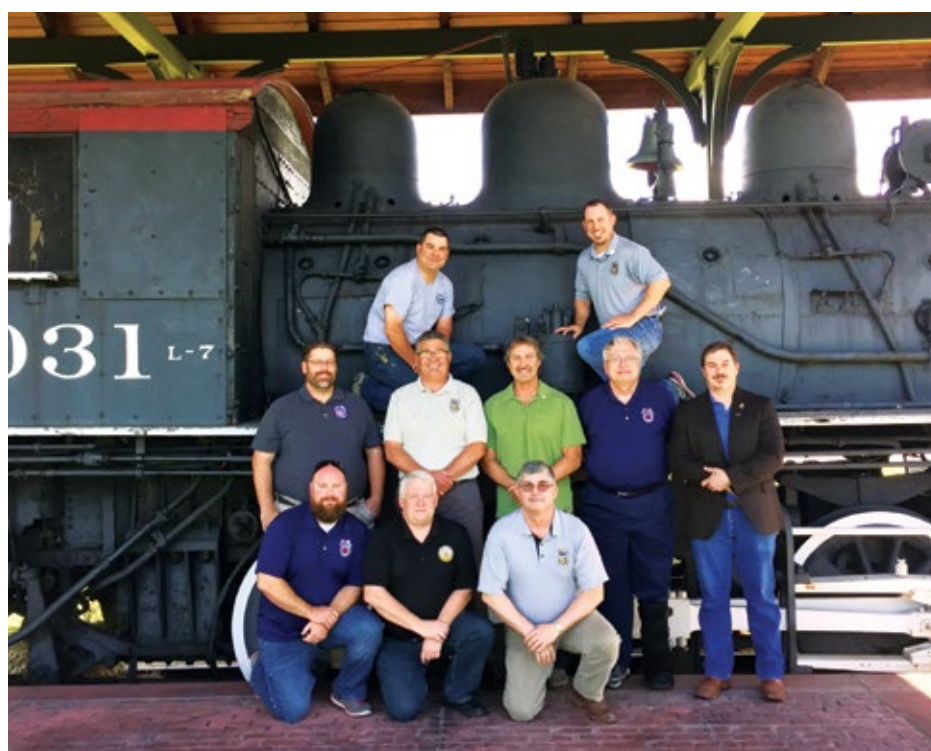
Officers, delegates and guests at the Montana State Legislative Board's quadrennial meeting in Billings, Mont., June 22-23, 2016.