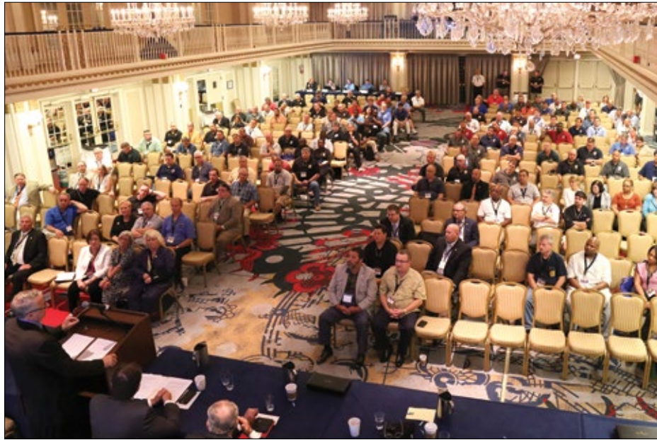
Opening ceremonies at the Drake Hotel in Chicago.