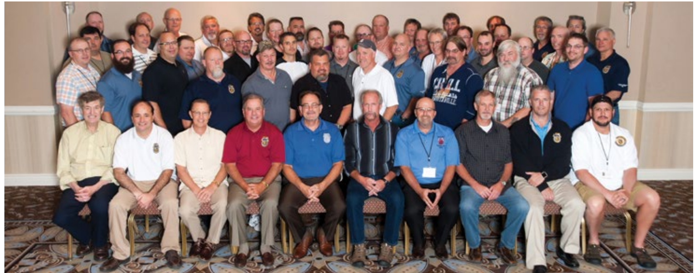
Officers, delegates and guests at the BNSF/MRL GCA 14th triennial meeting in Las Vegas, Nevada, on June 20, 2016.