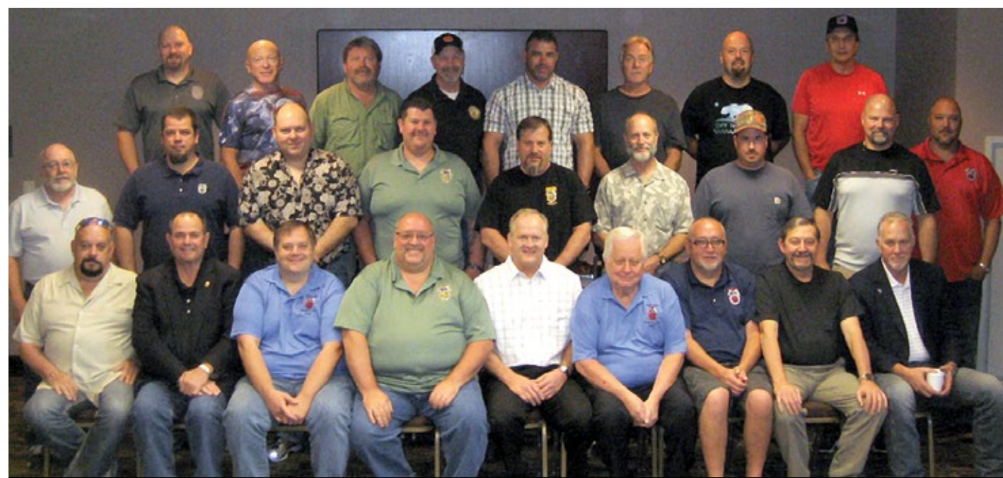
Delegates, officers and guests at the Union Pacific-Western Region General Committee of Adjustment's quadrennial meeting in Boise, Idaho, June 20-22, 2016.