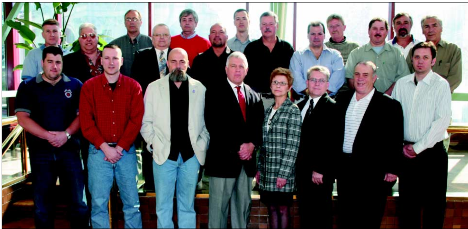
Delegates, officers and guests attending the May 2007 Triennial Convention of the Conrail SAA/CSXT Northern District GCoFA.

Delegates handled a variety of issues during the long, two-day work sessions. Among them were the decision to change from triennial to quadrennial meeting intervals, and the decision to create a new Alternate General Chairman position. The individual elected to that position would succeed the General Chairman should that office become vacant.