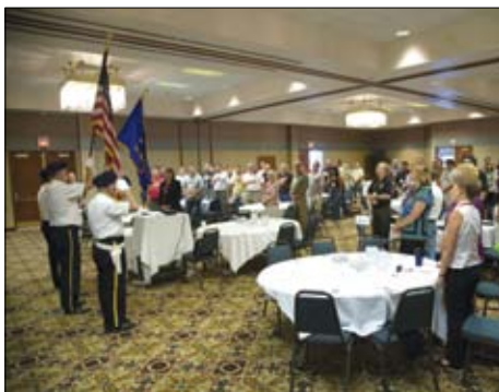
Presentation of the flags during the opening ceremonies.