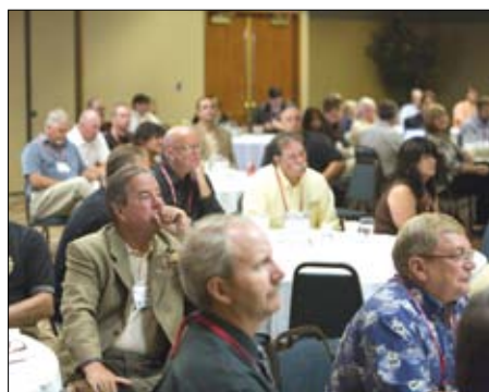
BLET members during the closed meeting.