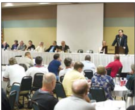
A packed house during the opening ceremonies.