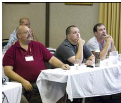
BLET members during the Local Chairman workshop.