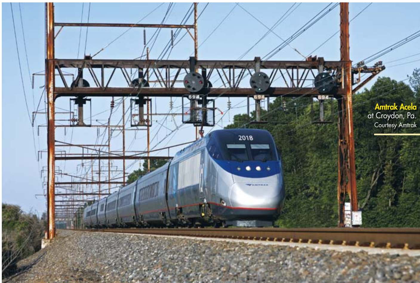
Amtrak Acela at Croydon, Pa.