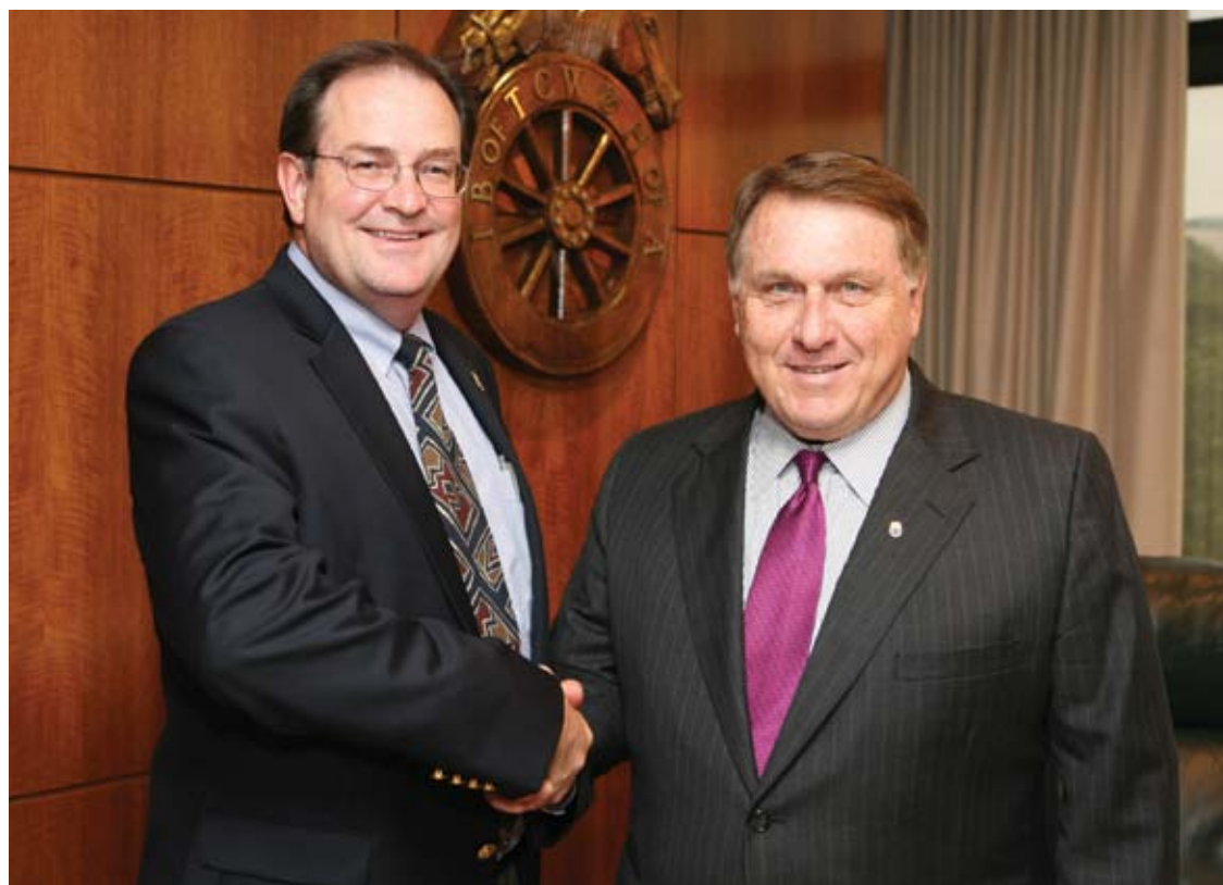
TEAMSTER » POWER: In August, BLET National President Dennis R. Pierce traveled to Washington, D.C., for a meeting with Teamsters General President James P. Hoffa.

vided invaluable assistance in numerous successful BLET organizing campaigns on short line railroads?