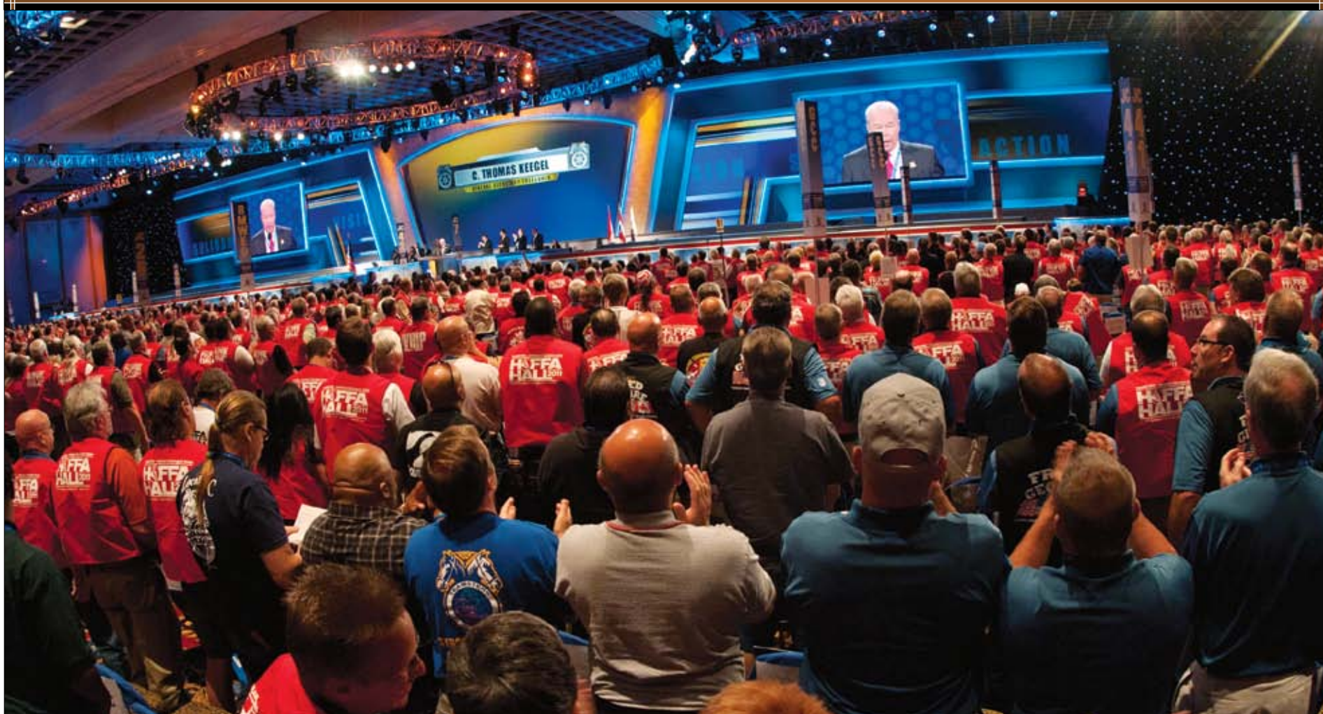
TEAMSTER POWER: Approximately 1,800 delegates attended the five-day convention in Las Vegas.

T he International Brotherhood of Teamsters opened their 28th International Convention on June 27 with plenty of noise and a new resolve to stand up for the American Dream.