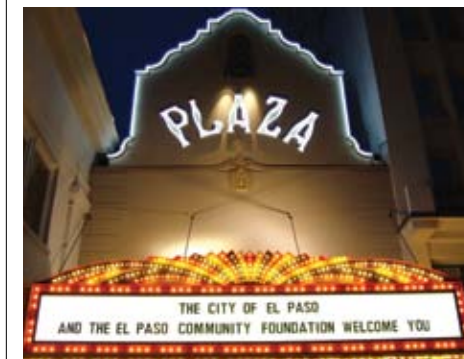
El Paso skyline: BLET members will find that El Paso has much to offer at the 76th SWCM.