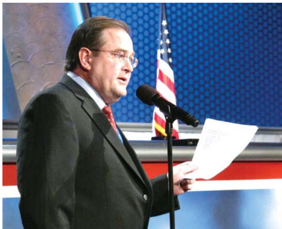
Rail Conference President: BLET President Dennis Pierce updates the 1,800 Teamster delegates on national wage/rule negotiations on behalf of the 70,000 member Rail Conference.

"But there is another side to coalition bargaining that is not quite as apparent — and doesn't get a lot of recognition — yet it has just as big an impact on our day-to-day work. The bonds of