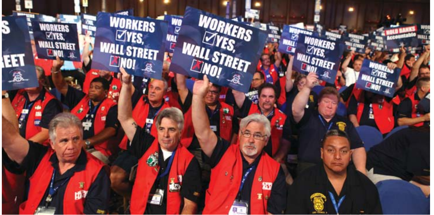
Wall Street Greed: Teamster delegates unanimously passed a resolution calling for the prosecution of chief executives and other Wall Street players responsible for the global financial crisis of 2008.

tion, the International Convention, which is held every five years, is the supreme policy-making body of the union with the power and authority to modify the Constitution, establish programs, address fiscal issues and set priorities. Throughout the week, delegates considered a number