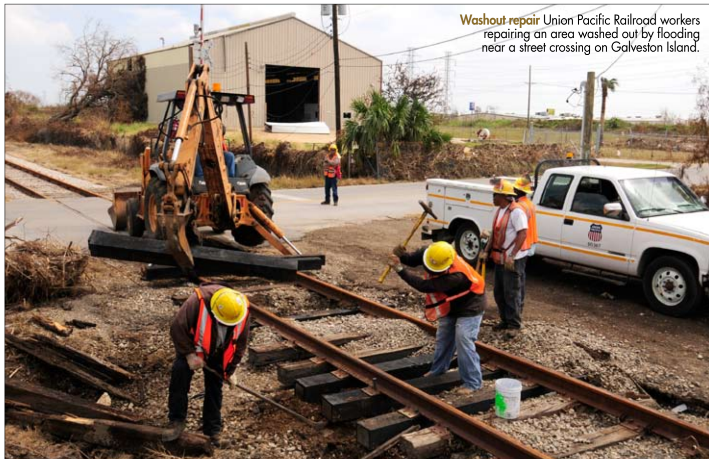
Washout repair Union Pacific Railroad workers repairing an area washed out by flooding near a street crossing on Galveston Island.

Make checks payable to: Southern Region Railroad Relief Fund