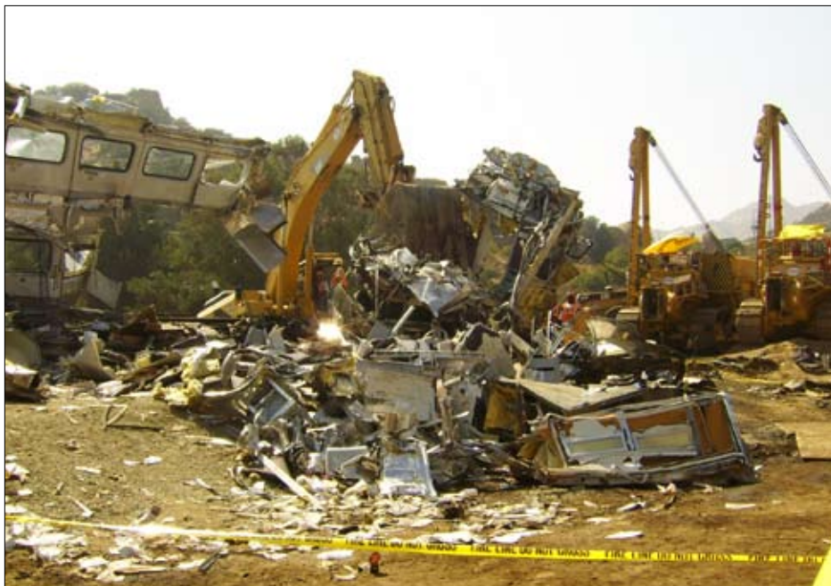
At the scene of the Metrolink tragedy