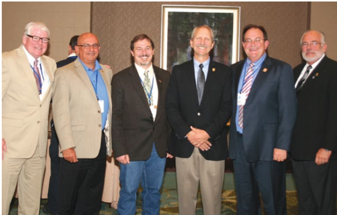
During the banquet at the 2015 IWC in Denver (from left):