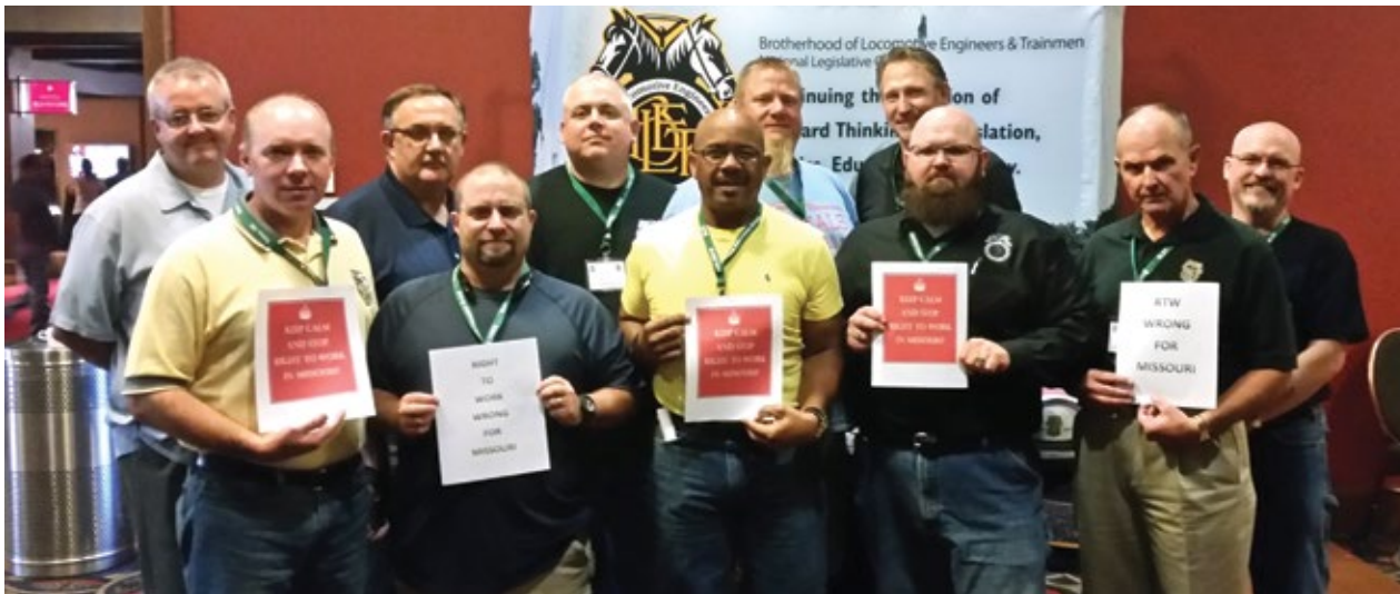
VOTE NO ON MISSOURI RIGHT-TO-WORK! BLET members and officers from the state of Missouri hold signs urging legislators to uphold Missouri Governor Jay Nixon’s veto of Right-to-Work legislation at the BLET’s Southwestern Convention Meeting (SWCM) in Tulsa, Oklahoma, on September 15. In June, Governor Nixon vetoed legislation that would have made Missouri the 26th Right-to-Work state in America, and anti-worker forces tried but failed to lobby enough legislators to override the governor’s veto in mid-September.

“Right-to-Work” states lag behind in wages, with workers averaging nearly $6,000 less annually. Eight of the ten states with the lowest minimum wages and nine of the ten states with the highest poverty levels are “Right-to-Work” states. ©©