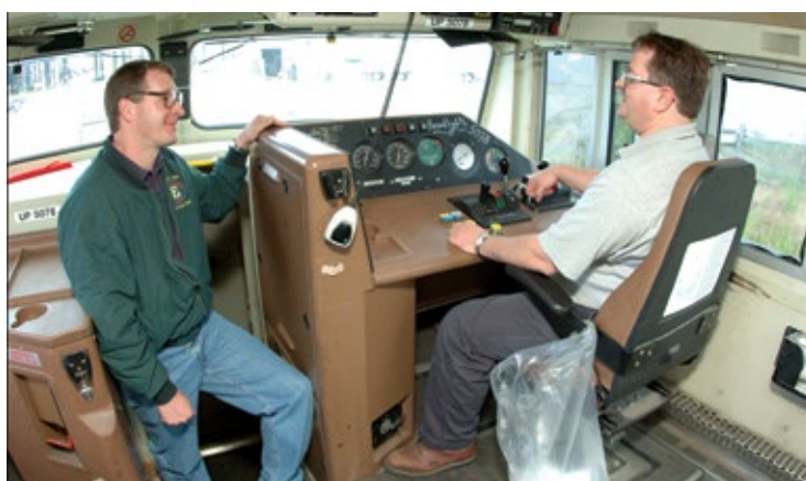
California is the largest state in the nation to require two people in the cab of a locomotive.