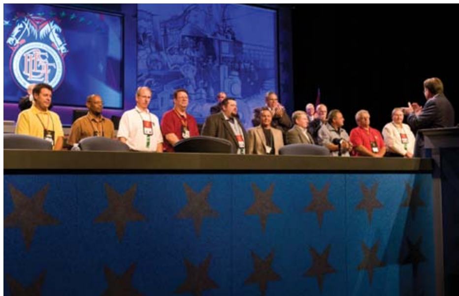
Newly-elected Alternate Vice Presidents receive a round of applause.