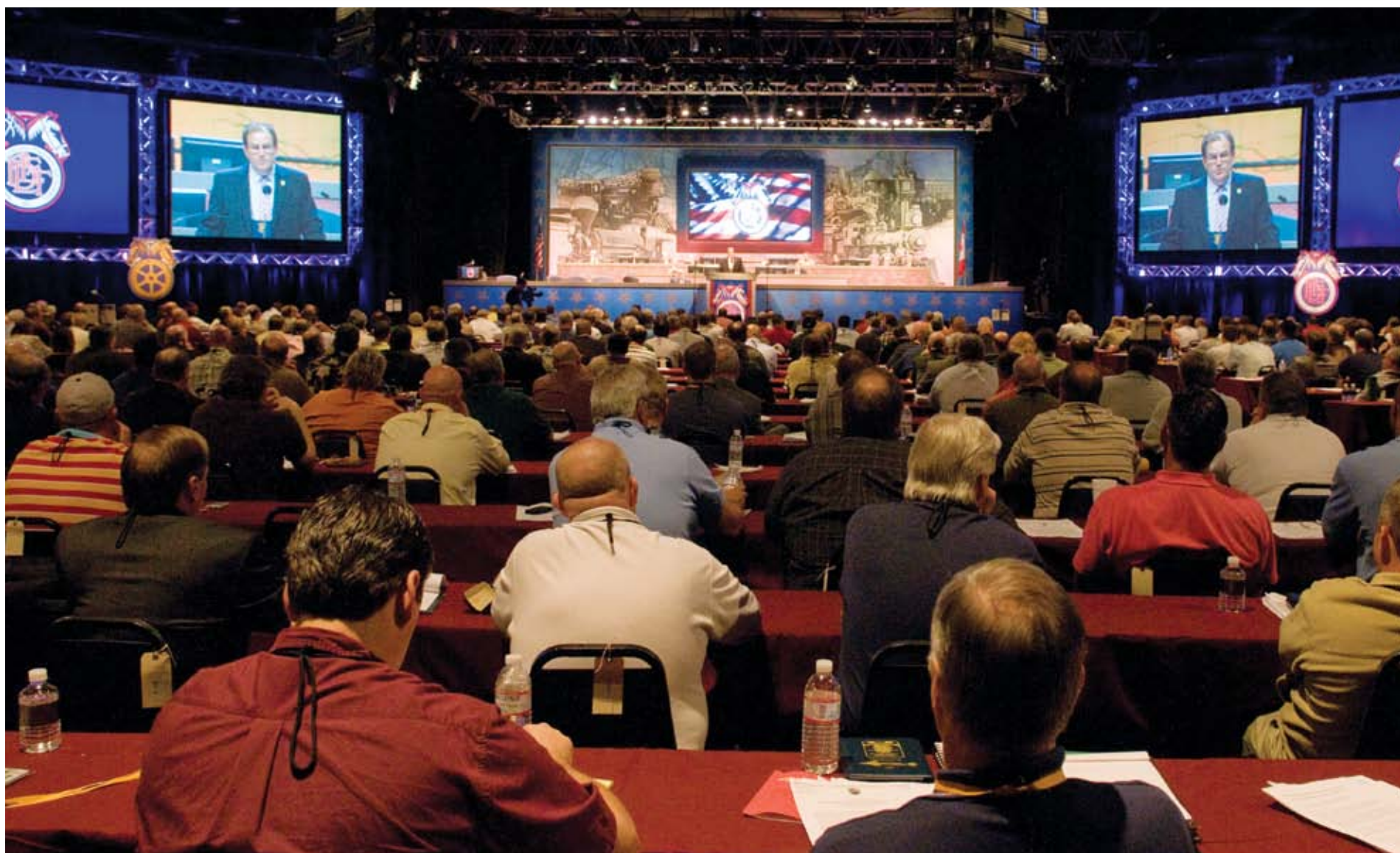
Back of the room: Large video monitors enabled delegates to see speakers clearly even from the back of the room, and allowed them to view proposed changes to the Bylaws in real time. Here, delegates enjoy a speech from National President Dennis Pierce.

ADDITIONAL NEWS ARTICLES AND PHOTOS FROM RENO WILL APPEAR IN THE WINTER 2010 ISSUE OF THE LOCOMOTIVE ENGINEERS AND TRAINMEN JOURNAL. IN THE MEANTIME, VISIT THE NATIONAL DIVISION PHOTO GALLERY AT FLICKR: WWW.FLICKR.COM/PHOTOS/BLETUNION