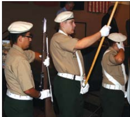
Presentation of the flags