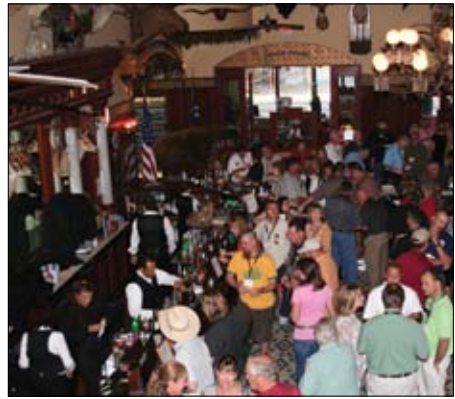
Dinner at the Buckhorn Saloon