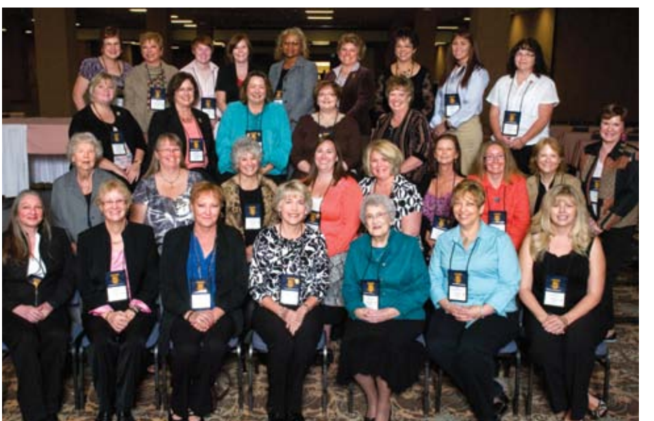
Officers, delegates and members attending the BLET Auxiliary's First Quadrennial Convention.