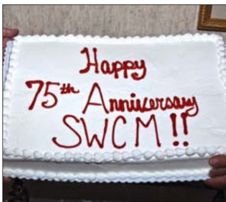
Commemorating a milestone