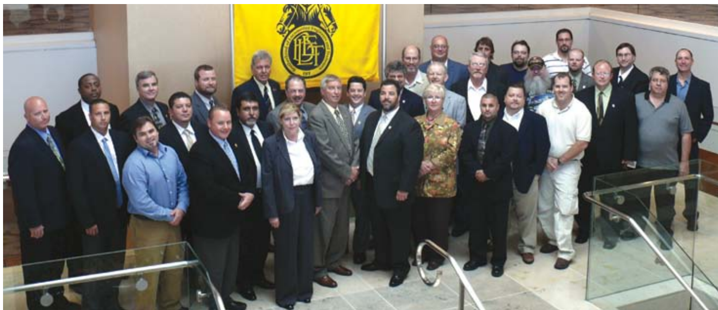
Officers and delegates attending the 13th Quadrennial meeting of the Illinois State Legislative Board, September 23-24, 2010.

"I would like to thank all those who have given me their support. I consider