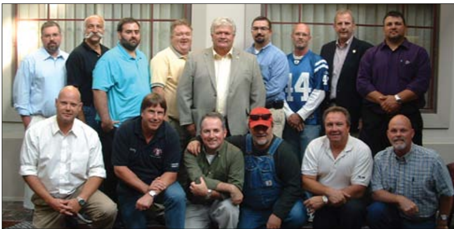
Officers and delegates of the Indiana State Legislative Board at their quadrennial convention in Indianapolis, Ind., September 28-29, 2010.