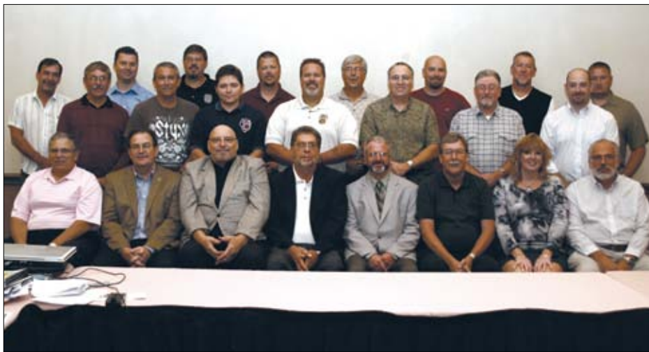
Officers, delegates and guests at the quadrennial meeting of the Union Pacific-Northern District General Committee of Adjustment, September 30, 2010.