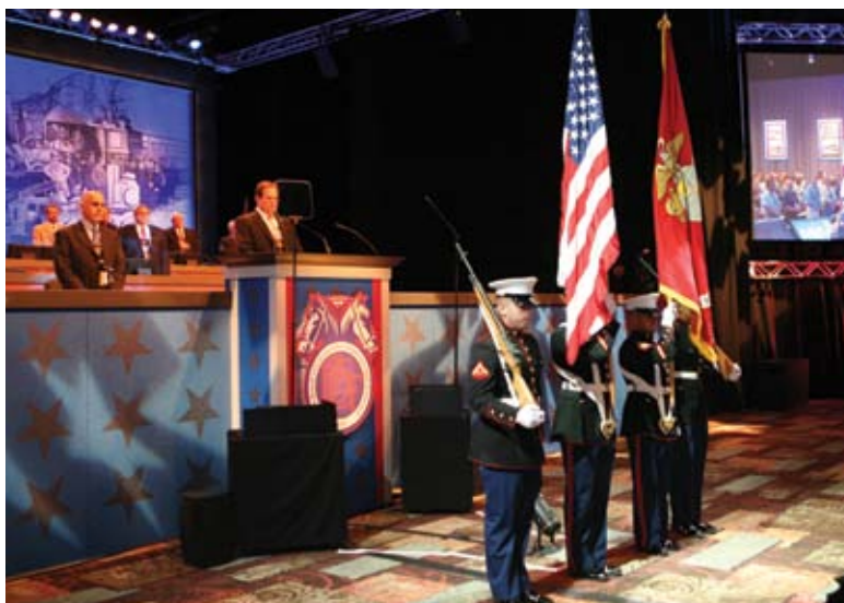
Presentation of the colors during the opening ceremonies.