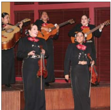
Dinner entertainment at the Buckhorn Saloon