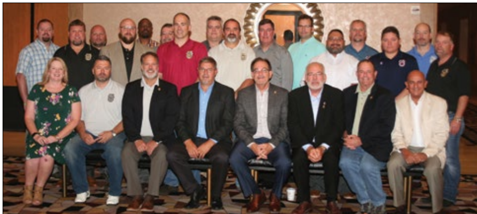
Members, officers and guests at the UP-Northern Region GCA's quadrennial meeting in Las Vegas on September 27, 2018.