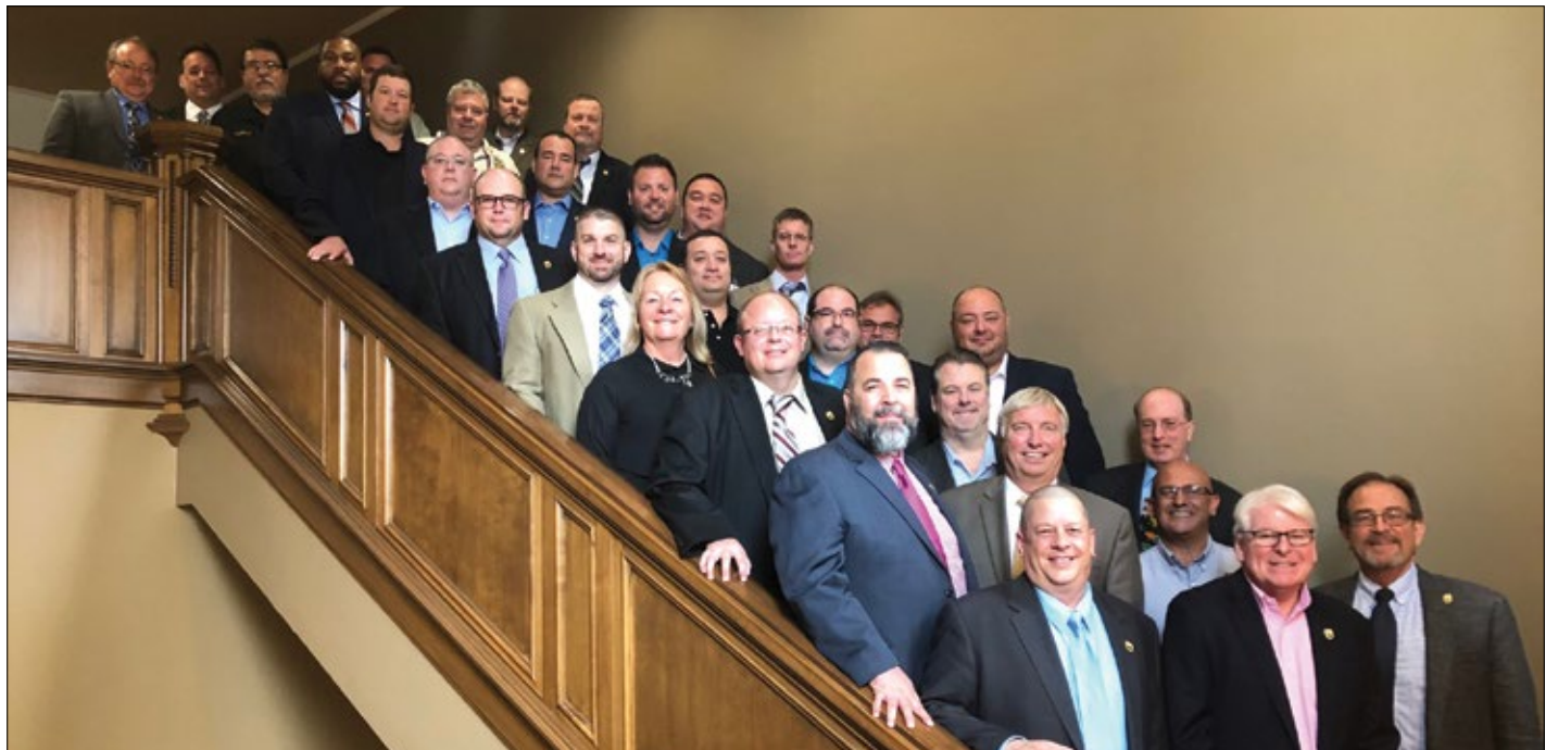
Delegates, officers and guests attending the Illinois State Legislative Board's 15th quadrennial meeting in Springfield, Ill., September 5-7, 2018.