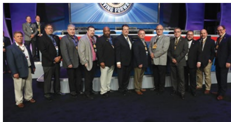
The new slate of Alternate Officers of the BLET National Division elected by acclamation at the Fourth National Convention