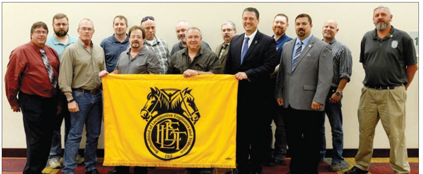
Members of the Indiana State Legislative Board at their 14th quadrennial meeting in Indianapolis on September 12-13, 2018.

"I offer my congratulations and sincere thanks to all officers of the Indiana State Legislative Board for their com-