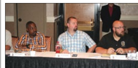
Officers and delegates of the UP-NR GCA.

These Brothers have demonstrated great skill and professionalism in representing our members, and I have every confidence they will continue to do so in the months and years ahead."