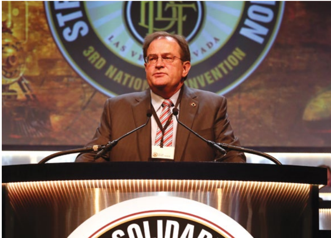
President Pierce presiding over the BLET's Third National Convention in Las Vegas as delegates deliberate over changes to the BLET's Bylaws.

Looking ahead, we plan to expand the availability of the Edu-