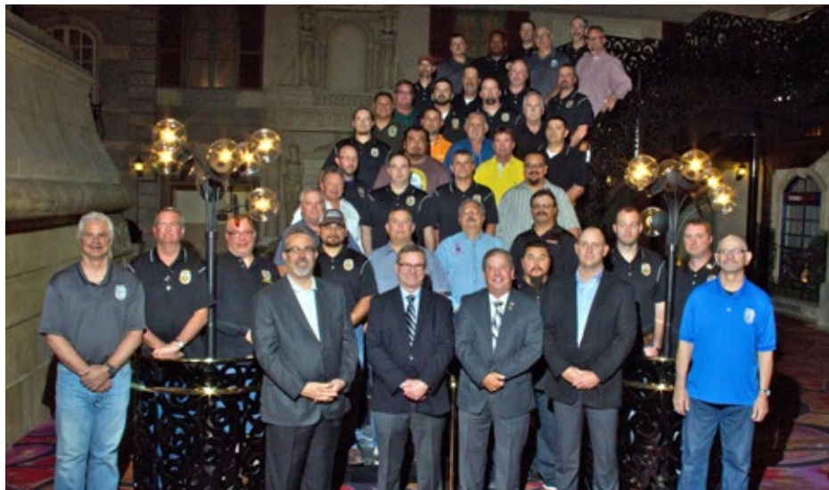
Delegates, officers and guests at the BNSF (former ATSF) General Committee of Adjustment meeting in Las Vegas, which concluded on October 24, 2014.