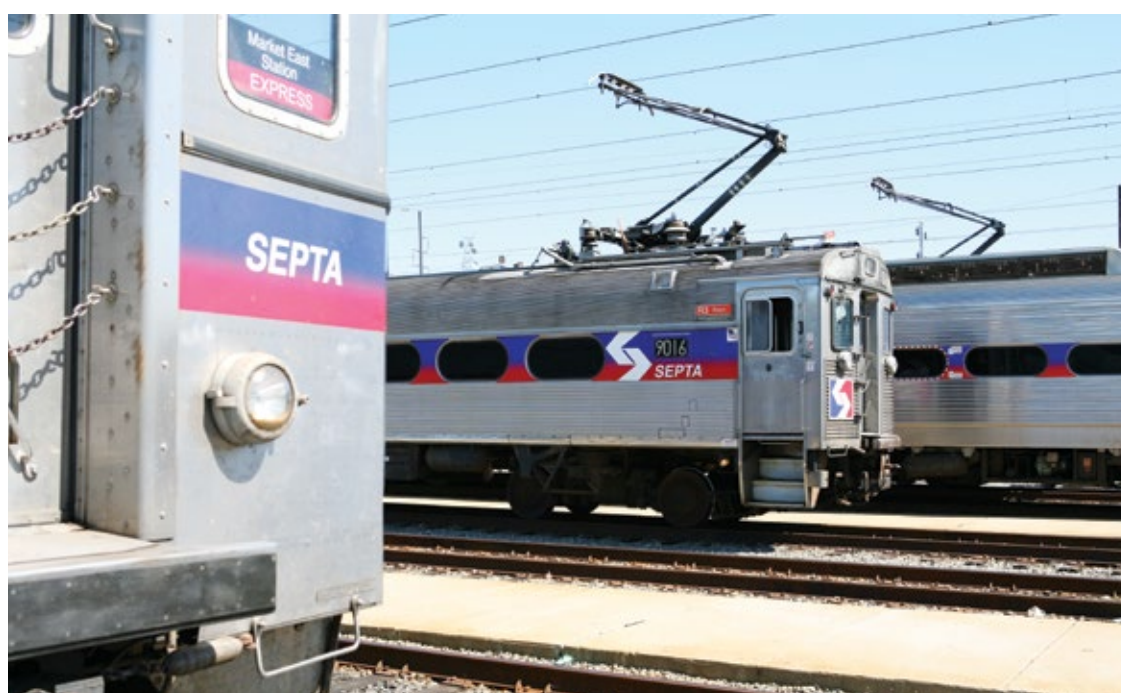
Sleep deprivation is becoming an issue for locomotive engineers at SEPTA as the railroad seeks to renew a safety waiver that would limit rest time for operating crews.