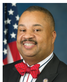
Donald M. Payne, Jr.