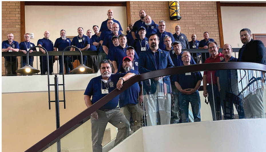
Officers, members and guests at the CSX-Northern Lines GCA meeting held in Pittsburgh, Pennsylvania, May 4-6, 2021.