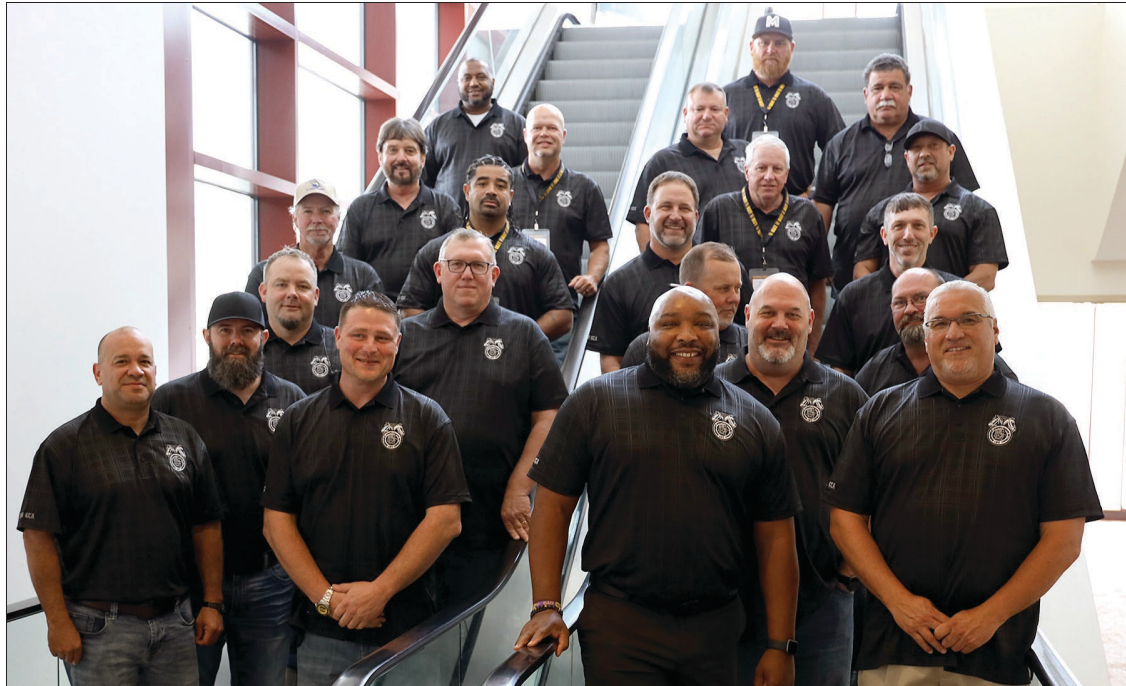
Members and officers of the BLET's Union Pacific-Southern Region GCA at the Austin regional meeting, July 13, 2021.

For GCAs that are comprised of a single Division, the election of the Local Committee of Ad-