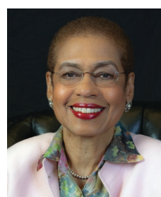
Eleanor Holmes Norton

The House Transportation and Infrastructure (T&I) Committee approved the bill by a 38-26 vote on June 10. Republicans Brian Fitzpatrick of Pennsylvania and Jenniffer Gonzalez-Colon of Puerto Rico joined the 36 Democrats on the Commit-